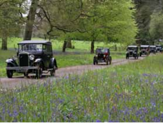
The Cornwall Austin Seven Club visited Pencarrow House with the VAR and the Austin Ten Drivers Club