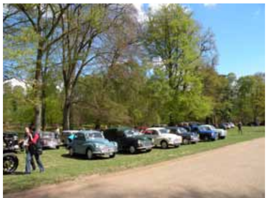
The Sherbucks Noggin of The Morris Register