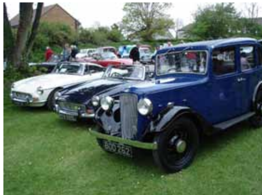
The Royal Oak's car park was crammed full from 8.30 am until after 5 pm.