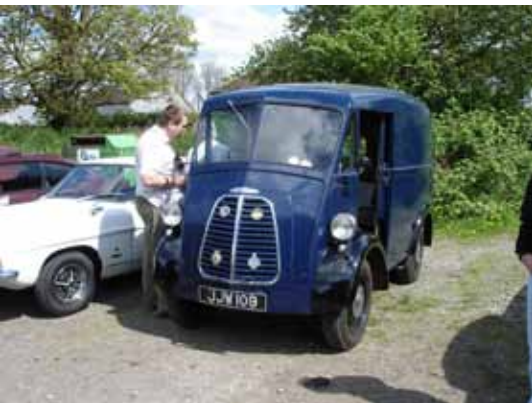
Some light commercials, like this Morris J Type, made it through the narrow lanes to the Royal Oak.