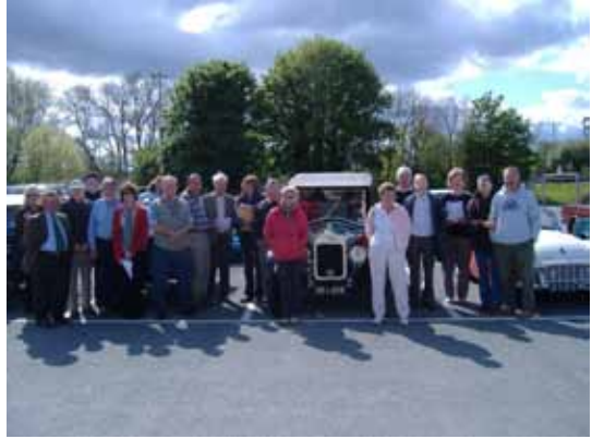
The Salop Yesteryear Motor Club organised a treasure hunt for DID.