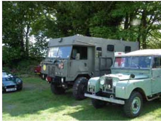
The ambulance is a 1977 Land Rover FWC and the Land Rover SI is from 1954 (at the Royal Oak).