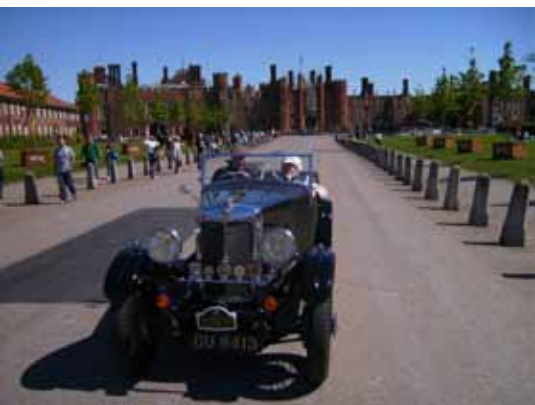
The Early MG Society overheard a youngster at Hampton Court asking if all these cars once belonged to King Henry VIII.