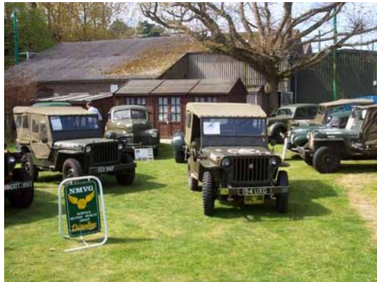
35 members from the Norfolk Military Vehicle Club visited Carlton Colville Transport Museum.