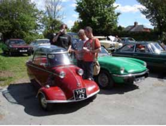
This Messerschmitt created a great deal of interest at the Royal Oak