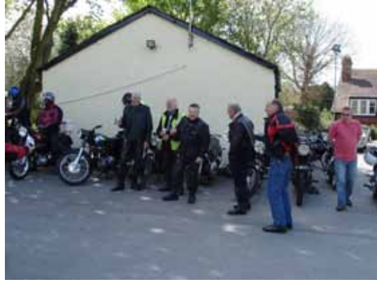
Over 40 AJS and Matchless owners enjoyed the hospitality at the Royal Oak