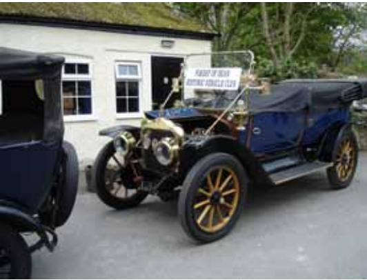
The oldest vehicle at the Royal Oak, a 1911 White from the Forest of Dean. The car is in regular use and is much enjoyed.