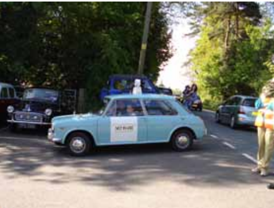
One of the hundreds taking part in the Horsham Histories DID run